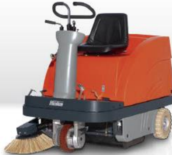
Sweepmaster B900 R