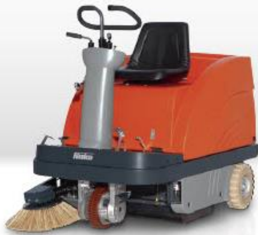
Sweepmaster B900 R