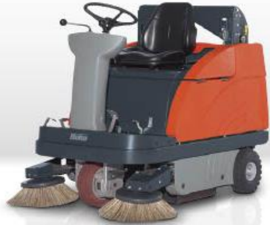
Sweepmaster B980 RH