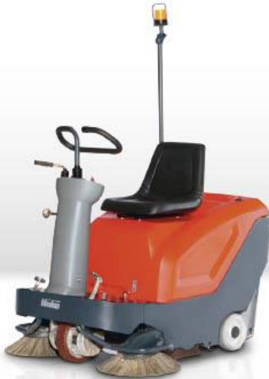
Sweepmaster B800 R